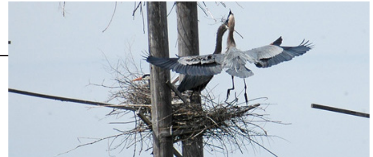
Opportunity for functional nest.