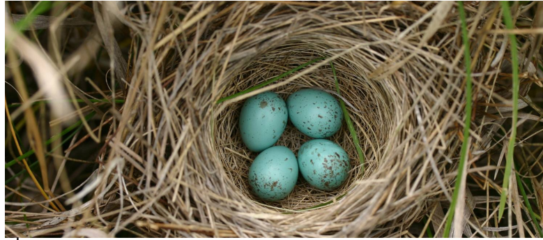
Shelter through landform topography.

At the base is a landform that acts as shelter for people. It blends into the landscape and creates the illusion of a depression at its centre. Limestone blocks will retain the landform while also creating amphitheater seating in the perceived depression. The vertical sculptural elements, constructed from utility poles and cross braces of metal or wood, would organically surround the core of the space, expressing the visual vernacular of the nest habitat while also creating opportunity for functional habitat.