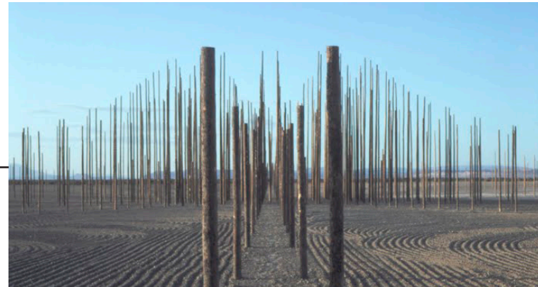
Visual vernacular of nest habitat.